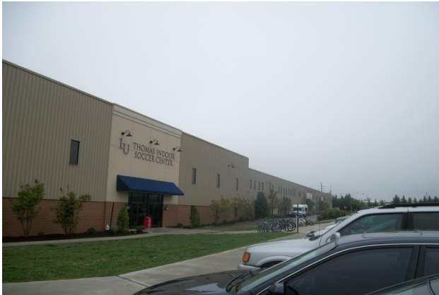
Front – completed and original